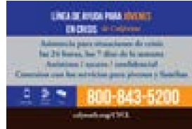
3x4 Calling Cards (front/back)