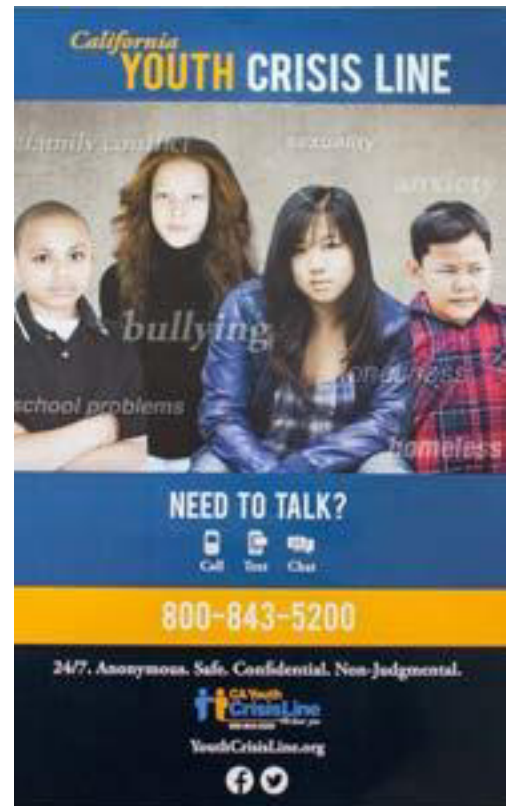
11x17 Crisis Line Posters