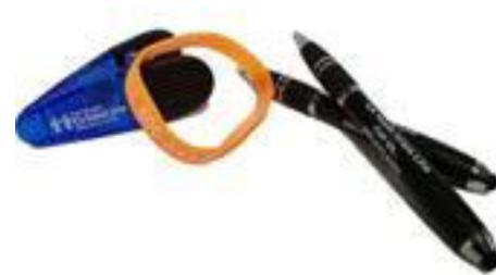
Magnetic Chip Clips Wristbands Stylus Pens