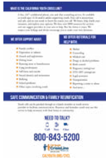
4x5 Info Flyers (front/back) *also available in spanish*